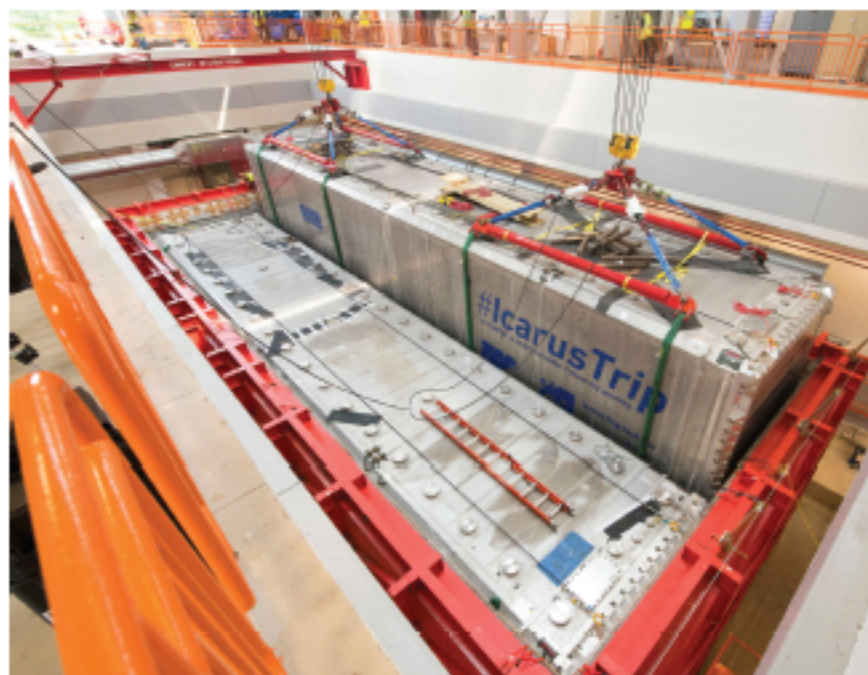
The ICARUS detector was installed in its Fermilab research hall in 2018.

Together these three detectors are powerful tools to investigate the evolution of neutrino oscillations over a short time and distance and thus explore whether the universe is even more complex than we think. This is the first time in history that several high-precision liquid-argon detectors have been strung together to conduct a neutrino physics experiment. The upcoming international Deep Underground Neutrino Experiment and Long-Baseline Neutrino Facility, hosted by Fermilab, will also use liquid-argon technology.