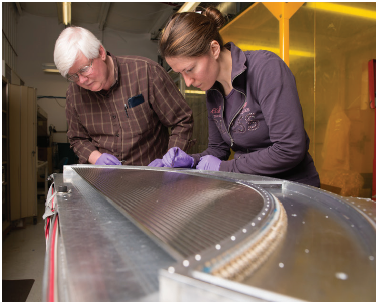
Inside Mu2e’s particle detector, about 23,000 metalized-Mylar straws are arranged in panels and filled with gas to record particle tracks.

The Mu2e collaboration will capture muons produced by Fermilab’s particle accelerators. If the Mu2e detector records electrons escaping with the precise energy of 105 MeV, scientists will have discovered the elusive transformation of a muon converting directly into an electron — and signs of new physics.